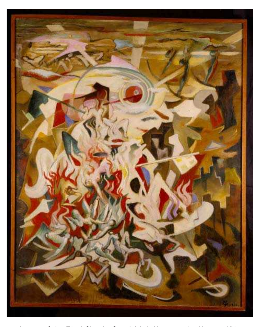
Image 9. Oskar Zügel, Sieg der Gerechtigkeit, Untergang des Unsterns Hitler, Zerstörung der Stadt Stuttgart (Schicksalsbild), 1934/1936, signed and dated, oil on canvas, 163 x 130,5 cm, © Katja Zügel.

Spain and France as well as Hamburg and Berlin. From 1925 on, he turned to abstraction and spent the time between 1933 and 1945 between Mallorca, Ischia and France. Evidently, he had grown out of the Stuttgart circle to become an international painter.