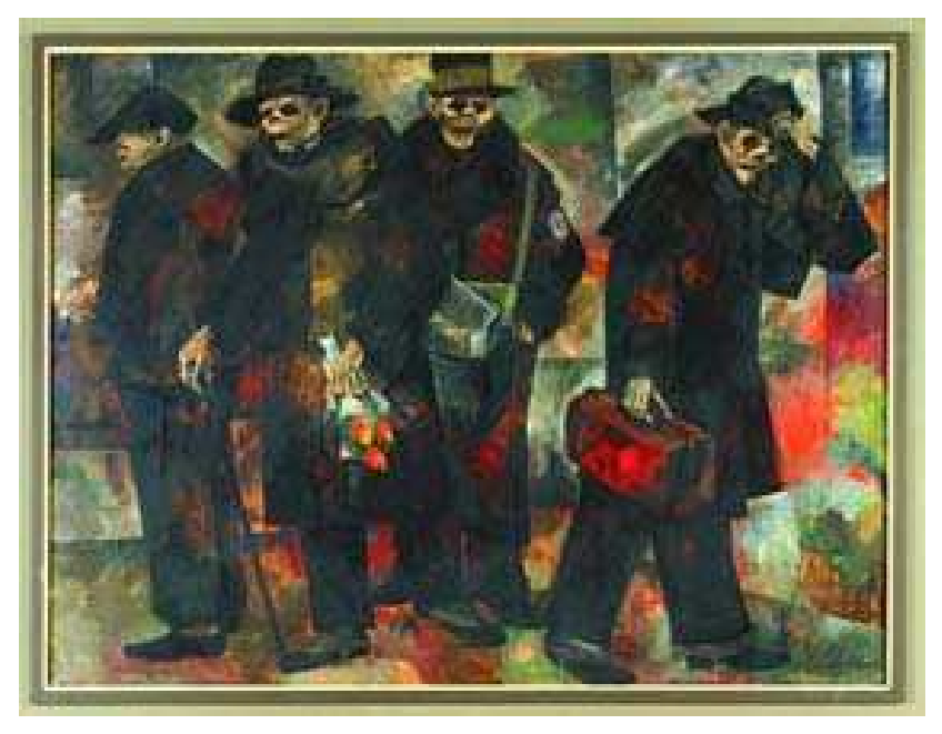
Image 5. Hermann Sohn, Die schwarzen Männer, 1934, © Kunstmuseum Stuttgart.

The Black Men (Image 5), painted in 1934, now in the Kunstmuseum of Stuttgart, shows four men with death's heads, in black robes, reminiscent of undertakers, one of whom has a swastika armband. Subtitled, The Rats Are