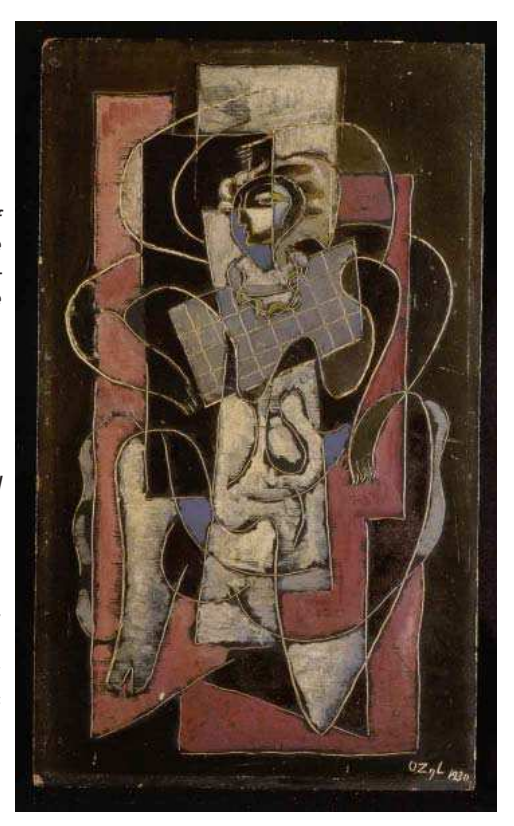
Image 8. Oskar Zügel, Genotzüchtigte Kunst III, Joseph Goebbels, 1930, signed and dated, 46,3 x 27 cm, © Katja Zügel.

Before leaving Stuttgart, Zügel had begun to work on a huge canvas that he later called his Schicksalsbild (picture of destiny). It was completed in Spain where it remained in his house until his return. The long title reads Victory of Justice - Downfall of the Unluckv Star Hitler Destruction of Stuttgart (Image 9). The painting was not contained in the recent exhibition Kassandra at the Deutsches Historisches Museum (November 19, 2008 - February 22, 2009) which focused on the Ahnungen und Mahnungen, (forebodings and admonitions) of artists of the twentieth century in front of imminent calamities (Heckmann and Ottomever 2009), although a more prophetic picture has hardly ever been painted. In a cubistic turmoil of splintering forms caused by a red cannonball signed by the swastika. bodies are tumbling down like fallen angels, while flames are flickering, apolcalyptic riders seem to shoot their arrows and only the ruins of burnt-out